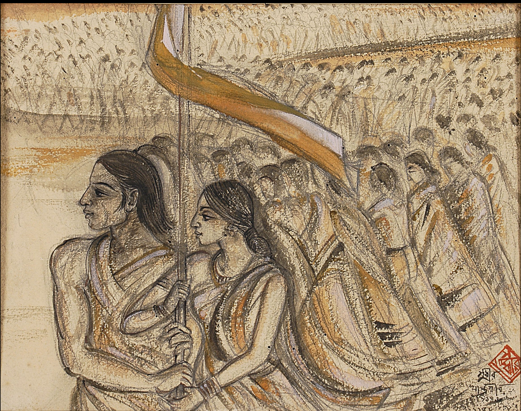
Sudhir Khasgiir, Untitled , 1946, Watercolour and graphite on paper, 1946